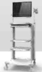
PT-V10c Endoscopic Trolley