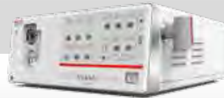
EPK-V1500c HD Video Processor